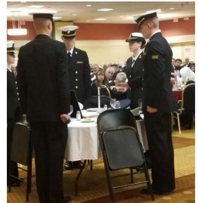
Here the five Midshipmen from the University of Arizona ROTC Program are performing the POW/MIA Table Ceremony at the January 2017 Exemplification Banquet.